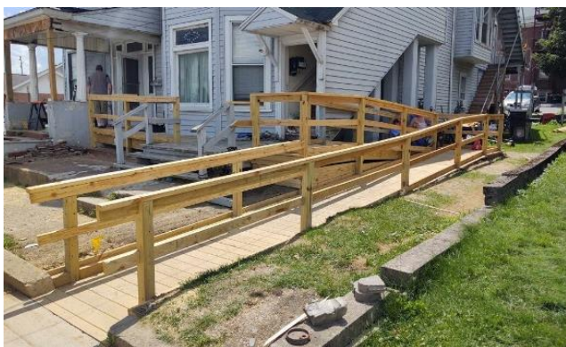
Completed ramp project