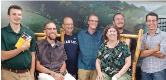
Our Summer Staff

This year looked very different at Bethany Retreat Youth Center with Covid-19 curtailing our regular summer program of parish groups, college groups and families (approximately 200-250 people) taking part in social justice outreach serving the